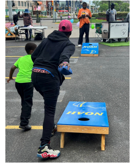
Cornhole is always a favorite at the party