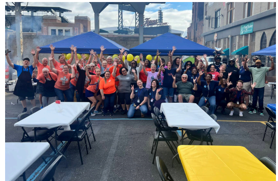
Staff & volunteers paused for a group photo before the block party